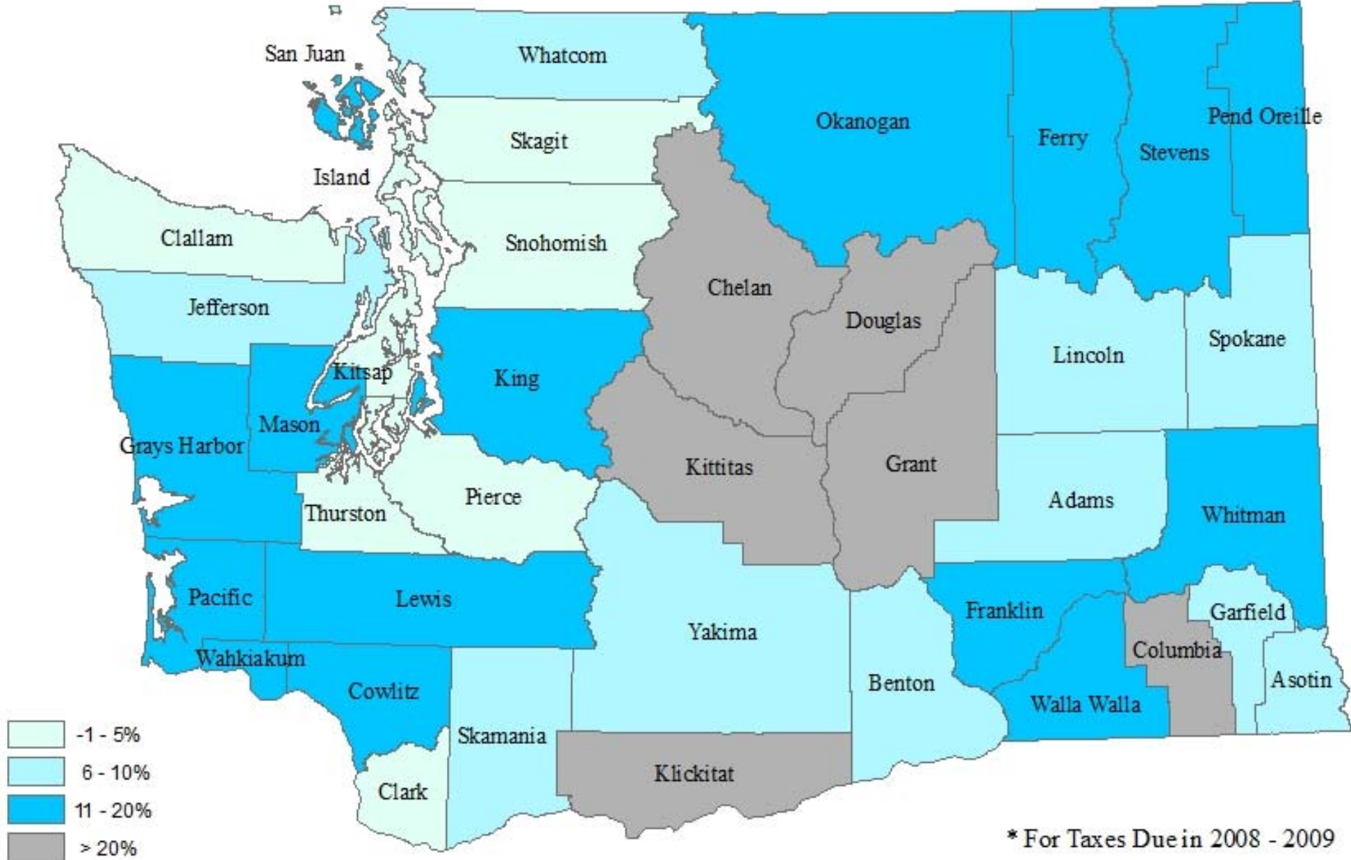
Chart 1. Growth in Assessed Value Assessment Years 2007-2008 *